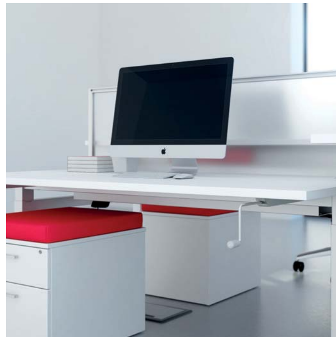
When required, the rotating lever can be extended into the activation position.