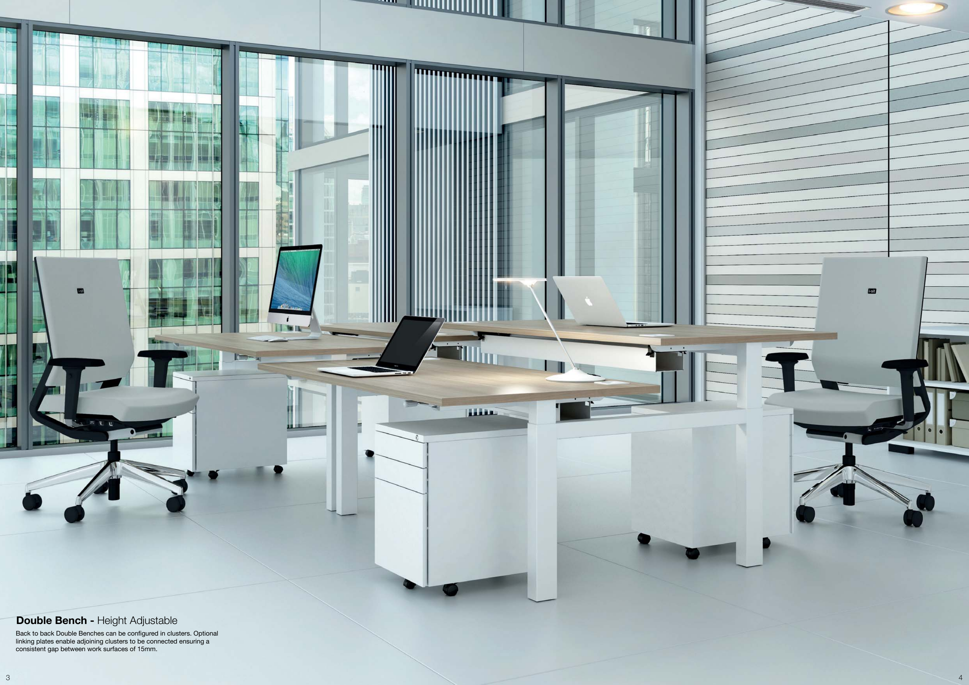
Double Bench - Height Adjustable Back to back Double Benches can be configured in clusters. Optional linking plates enable adjoining clusters to be connected ensuring a consistent gap between work surfaces of 15mm.