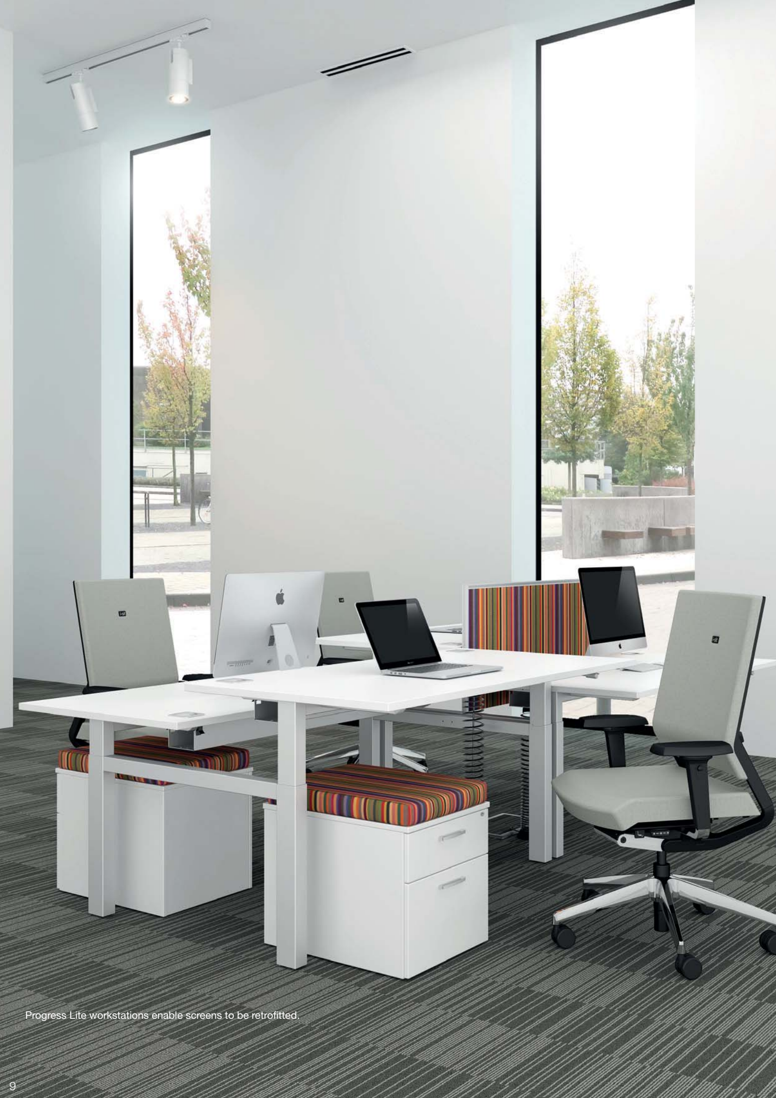
Progress Lite workstations enable screens to be retrofitted.