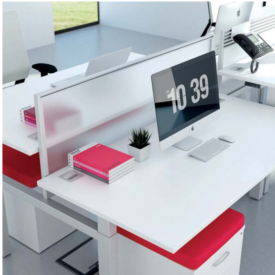
Access to the horizontal cable tray is gained via the desktop cable ports provided.