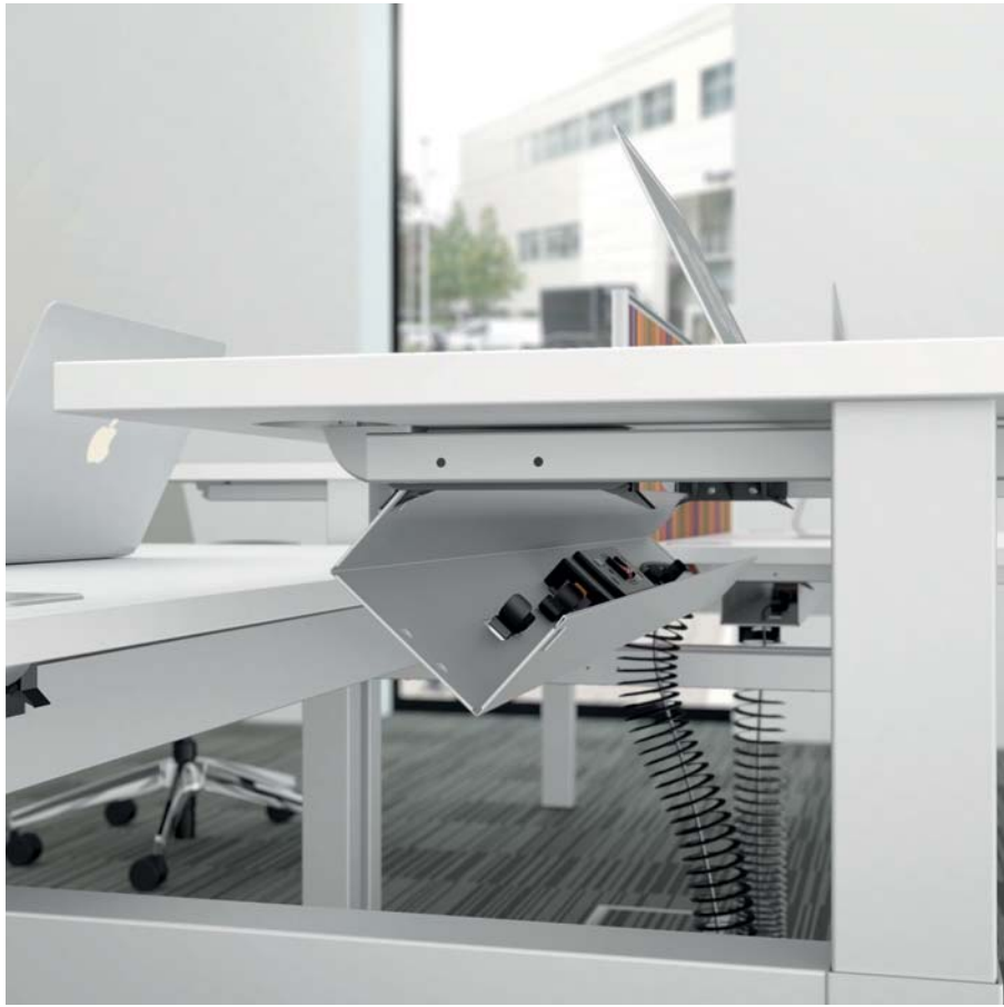
The cable tray can be accessed via release clips located at both ends of the tray.