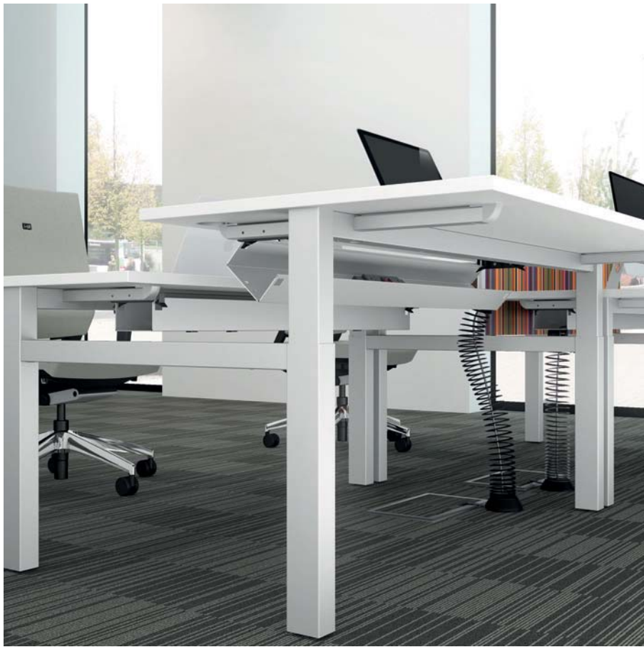
The horizontal cable tray can be accessed from the users side of the workstation. The image illustrates the tray in the open position.